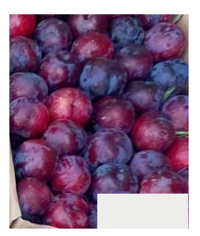
plum Red, gold and white