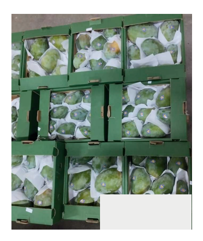
Manga Red, gold and white