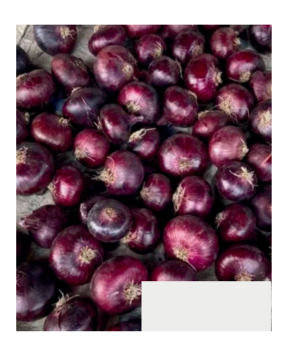
onion Red, gold and white