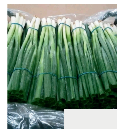
Spring Onions high quality