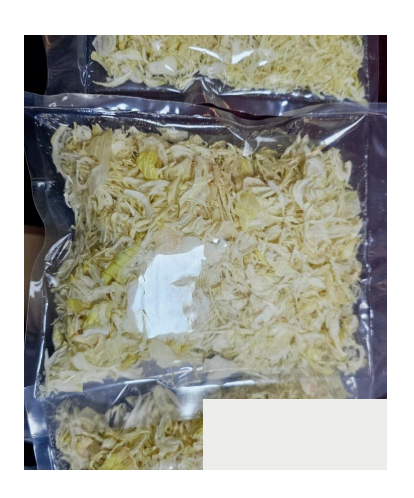
dried onion High quality