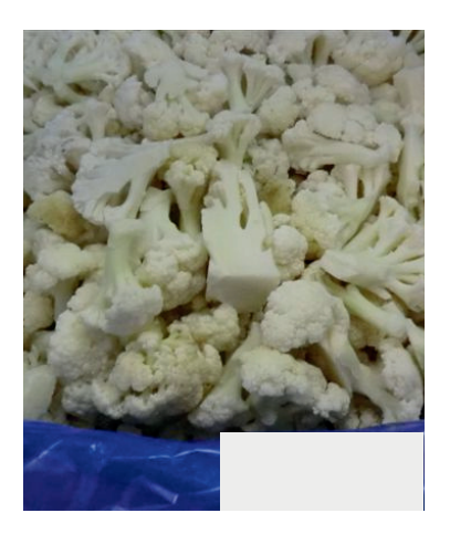
cauliflower Red, gold and white