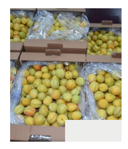
Apricot High quality