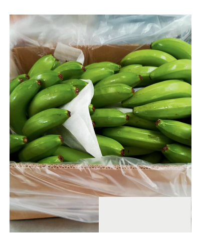
Banana Red, gold and white