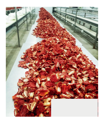
dried tomatoes Red, gold and white