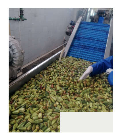
okra High quality