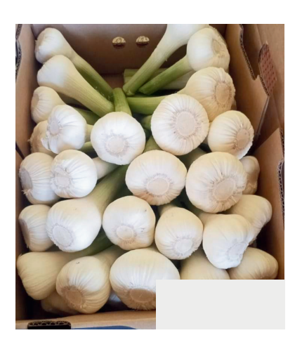
garlic high quality