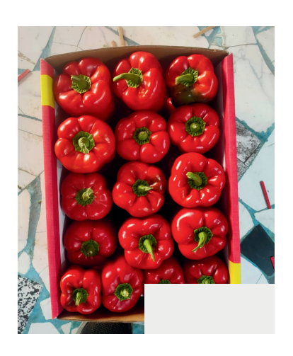
Sweet Pepper Red, yellow and green