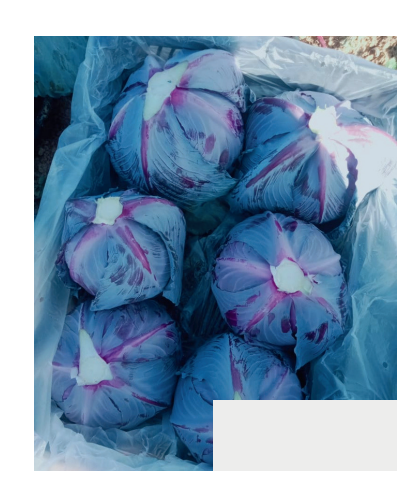
cabbage Red and white