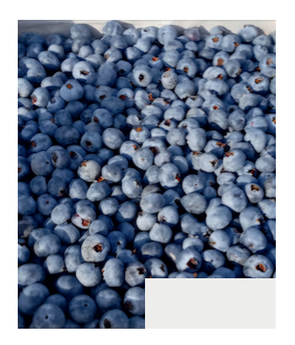
Blueberry High quality