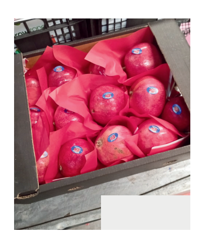
pomegranate High quality