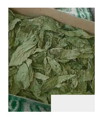
Dried Molokhia High quality