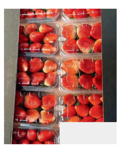
Strawberry High quality